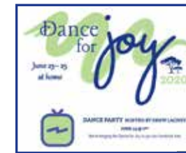
Virtual Dance for Joy