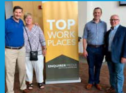
Camp Joy team at Top Workplaces event