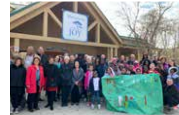
NRF Board with B&G Clubs campers