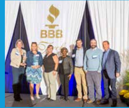
Camp Joy team accepting Torch Award