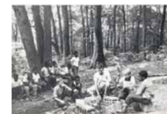
Social Justice and Camp Joy History